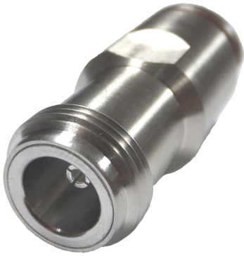
Type N Female for CNT-400 braided cable