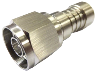
Type N Male for CNT-400 braided cable